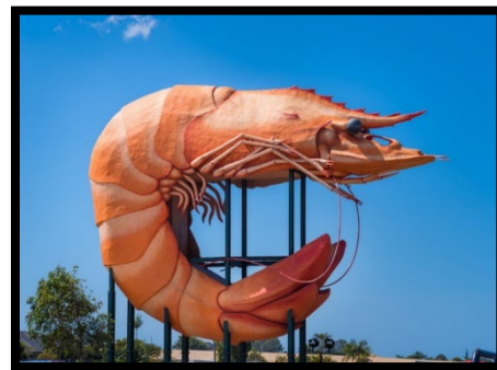
Ballina's Big Prawn

For some useful information about Ballina and the surrounding regions visit the following websites: